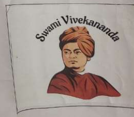
Poster Awarded 3 rd in the competition