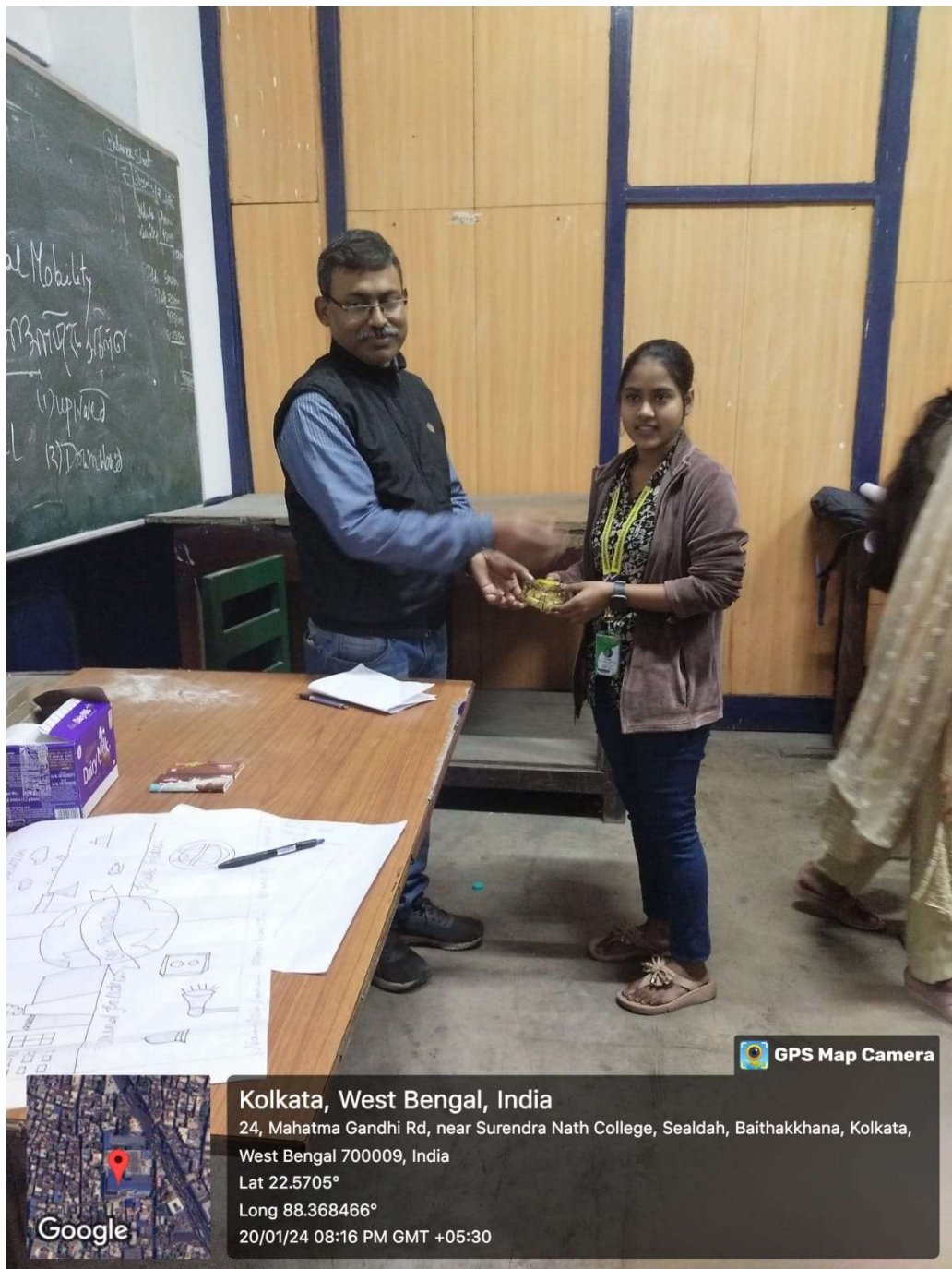
IQAC Coordinator giving prize to the winner (1 st )