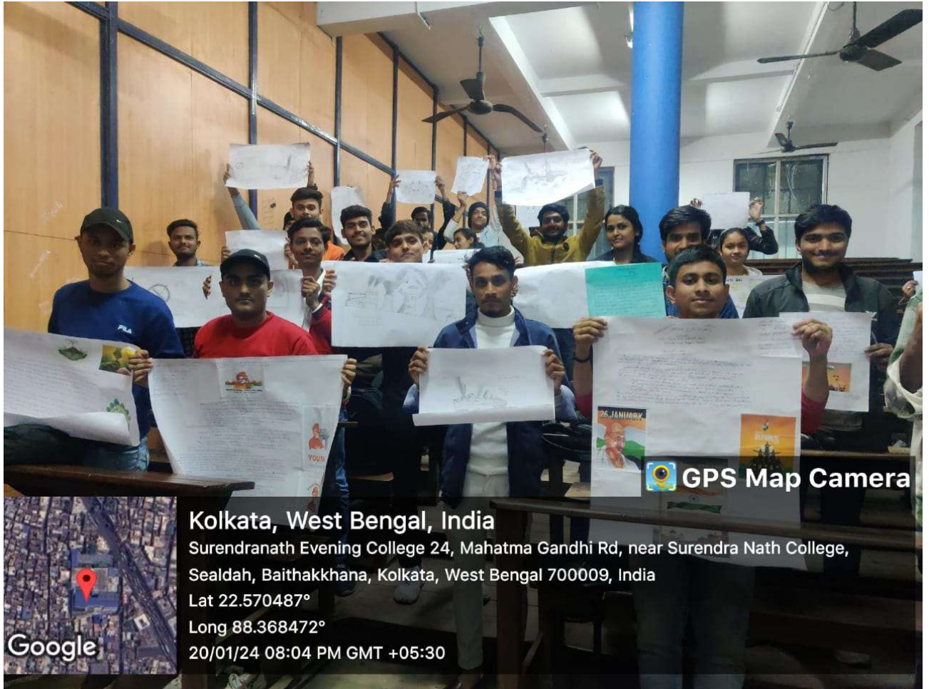
Students after the competition