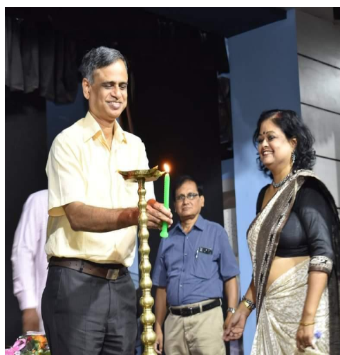
Inaugural ceremony by lighting the lamp