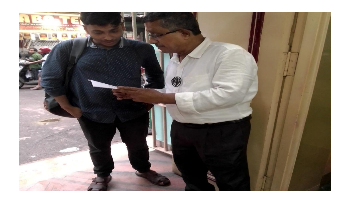
Checking of valid identity card at the entry point of our college