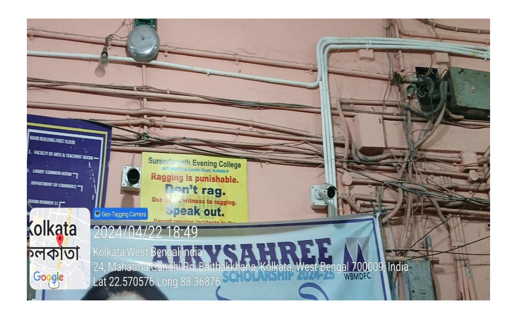
CC TV camera