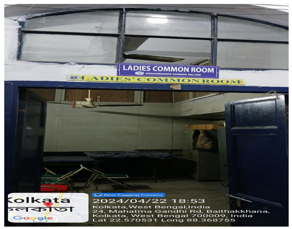
Ladies common room