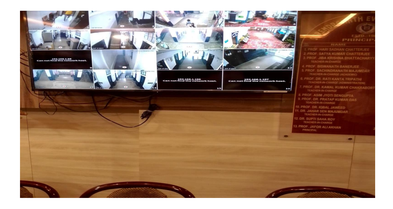
CCTV monitoring room